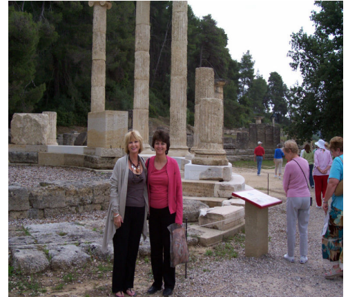
My sister and I in Greece.

Below is one of the clifftop monasteries of Meteora. The Monks still use baskets they sit in and go by rope from one side of the rock to another. It is quite a sight to see. Today only six monasteries survive as museums. They are sparsely occupied by a few monks and nuns but they offer a rare glimpse of Orthodox monastic life.