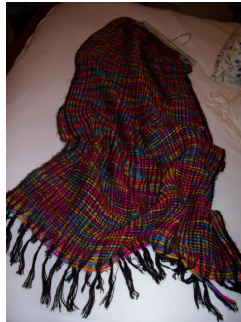
Wool Shawl from the lady in picture